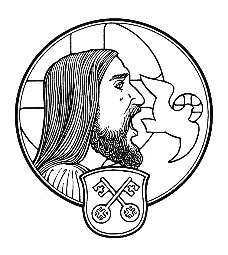
Order of Service for The Seventh Sunday of Easter (Exaudi) May 24, 2020